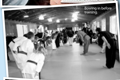
Bowling in before training.