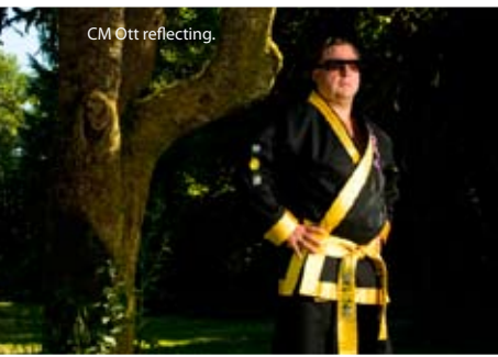
CM Ott reflecting.

carved out edges—a true weapon that can be taken any place. The second was a painting of me, riding on one of my favorite animals, the buffalo. It is without question, a gift from the heart. This masterful work of art was created by Grandmaster Billy Burchett's sister.